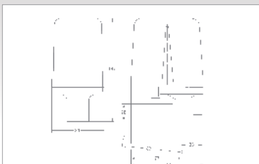
Pressure switch MDR-53